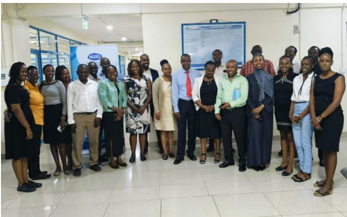
Kenya Bureau of Standards staff join members of the Nakuru Press for a group photo after a media workshop organized by KEBS at a Nakuru Hotel in March.